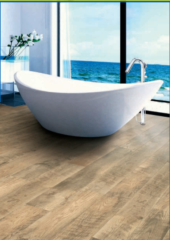
Mohawk® RevWood with WetProtect