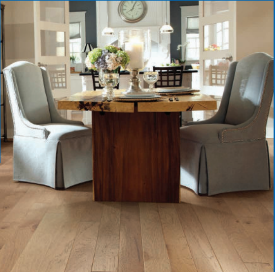
Shaw® Albright Oak