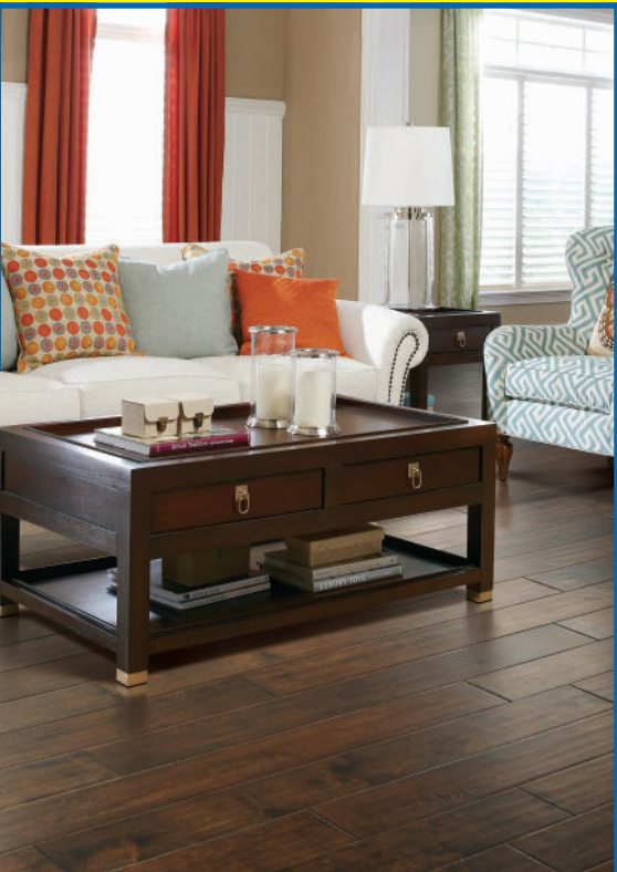
Mohawk® Camden Isle