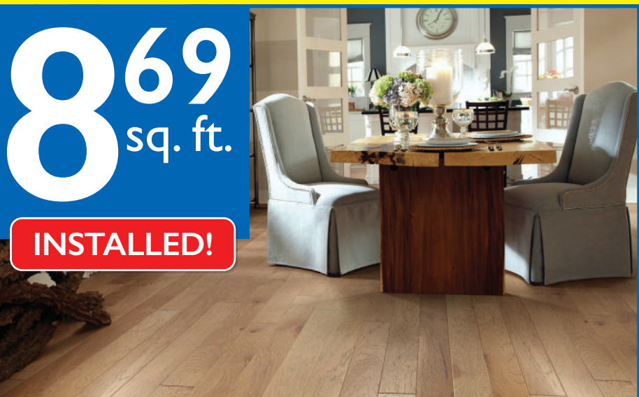
Shaw® Albright Oak