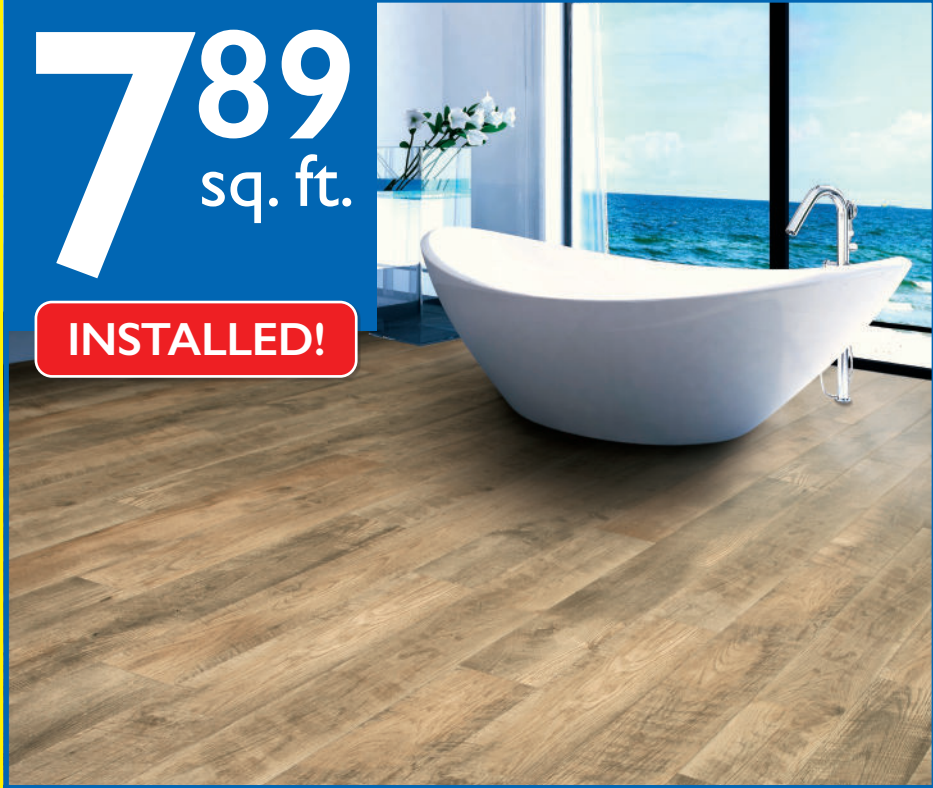
Mohawk® RevWood with WetProtect