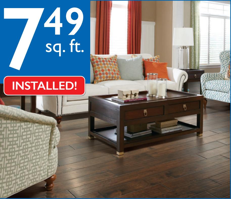
Mohawk® Camden Isle

INSTALLATION INCLUDED ON ANY CARPET OR FLOORING One Room or Whole House! Custom labor may be additional.