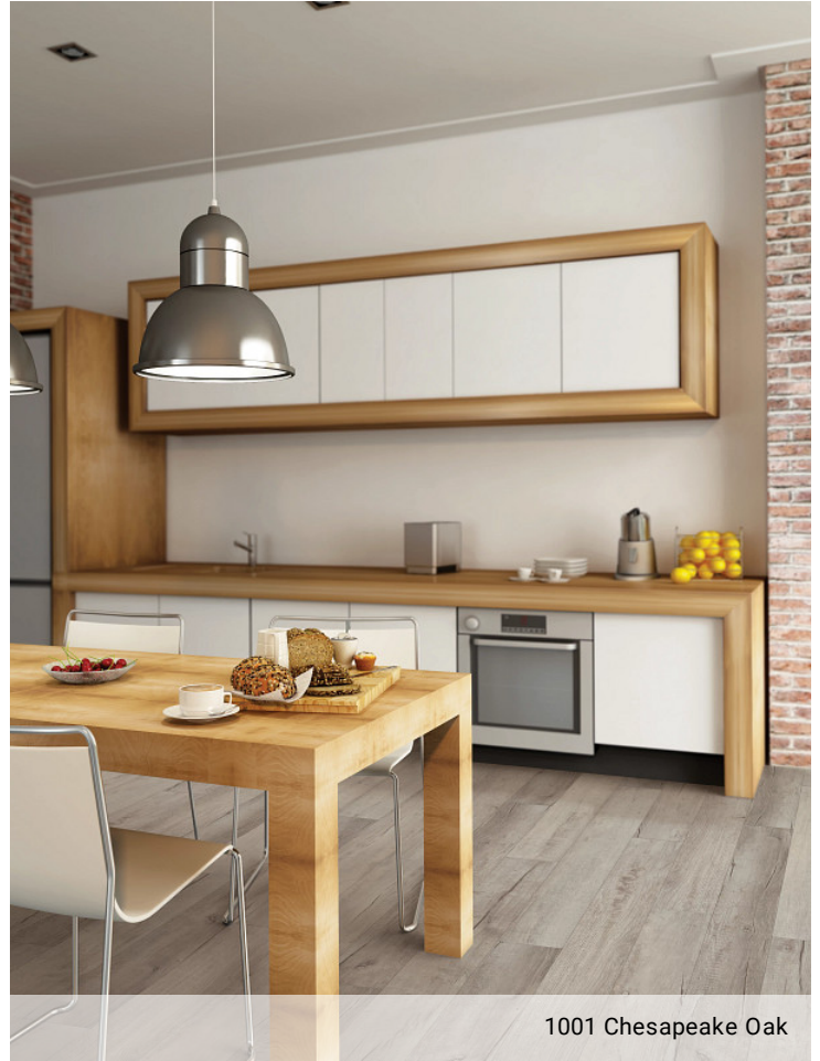
1001 Chesapeake Oak