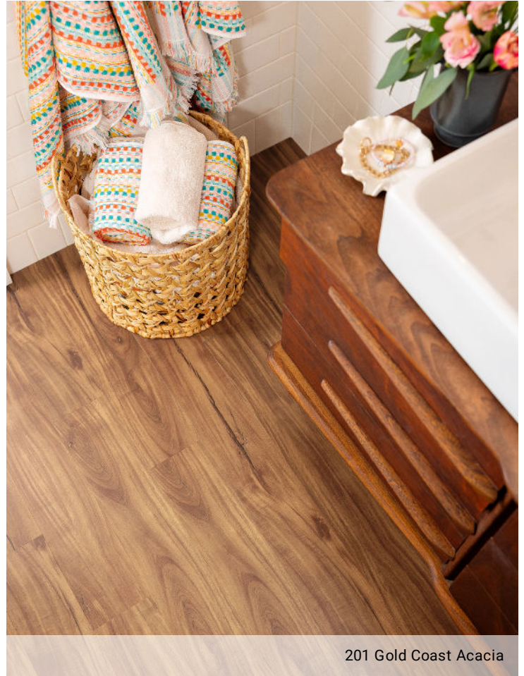
201 Gold Coast Acacia